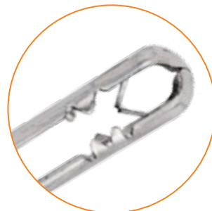
10 TEETH FOR MORE HOLD