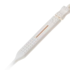
Ergonomical handle with defined breaking point