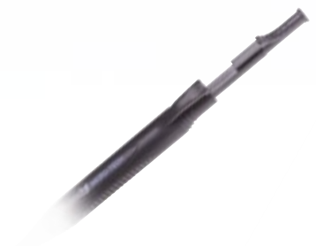
Compact ergonomical design