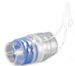
Latex cap with release thread